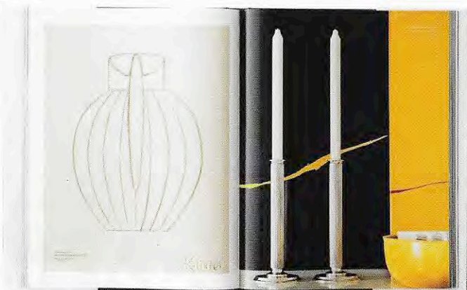
Below: A spread from Georg Jensen: Reflections .